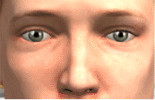
Extreme Close-up (ECU)