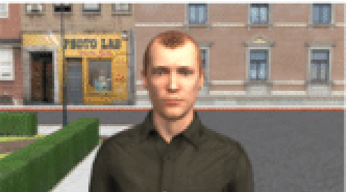
Medium Close-up (MCU)